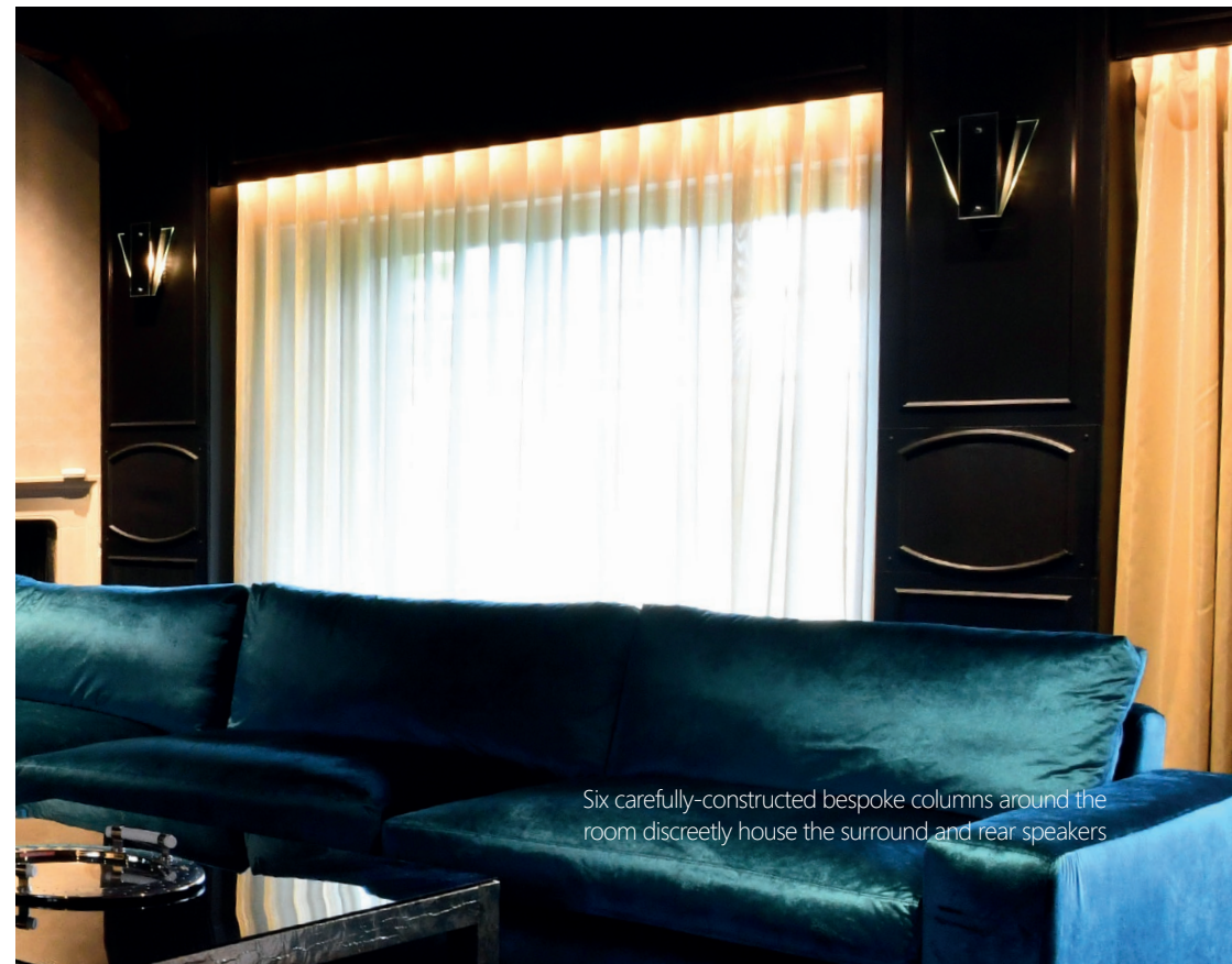
Six carefully-constructed bespoke columns around the room discreetly house the surround and rear speakers