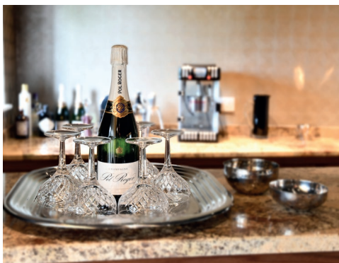
Cyberhomes constructed an Art Deco styled bar at the back of the room for in-movie drinks and popcorn.

The cinema room has access to a suite of 4K-capable video sources: Sky Q satellite TV, Apple TV for streaming films and TV content and an UltraHD Blu-ray disc player.