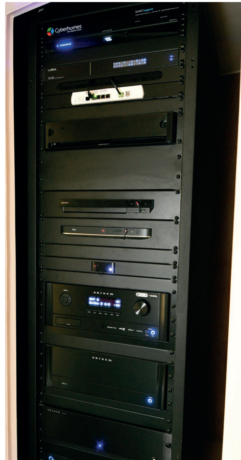
Dedicated AV rack located outside the cinema rooms ensures equipment noise can't be heard

"Cyberhomes were excellent. They completed the job on time, with a very professional finish and great design touches. They were flexible and accommodating. I would definitely recommend them and will use them for any future projects."