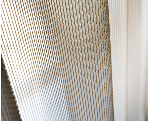
Vescom curtain fabrics absorb sound reflections whilst still allowing light to pass through.

wide Screen Research screen. With the source equipment located in a rack outside of the room (to eliminate background noise), a fibre-optic HDMI linked the video matrix to the projector.