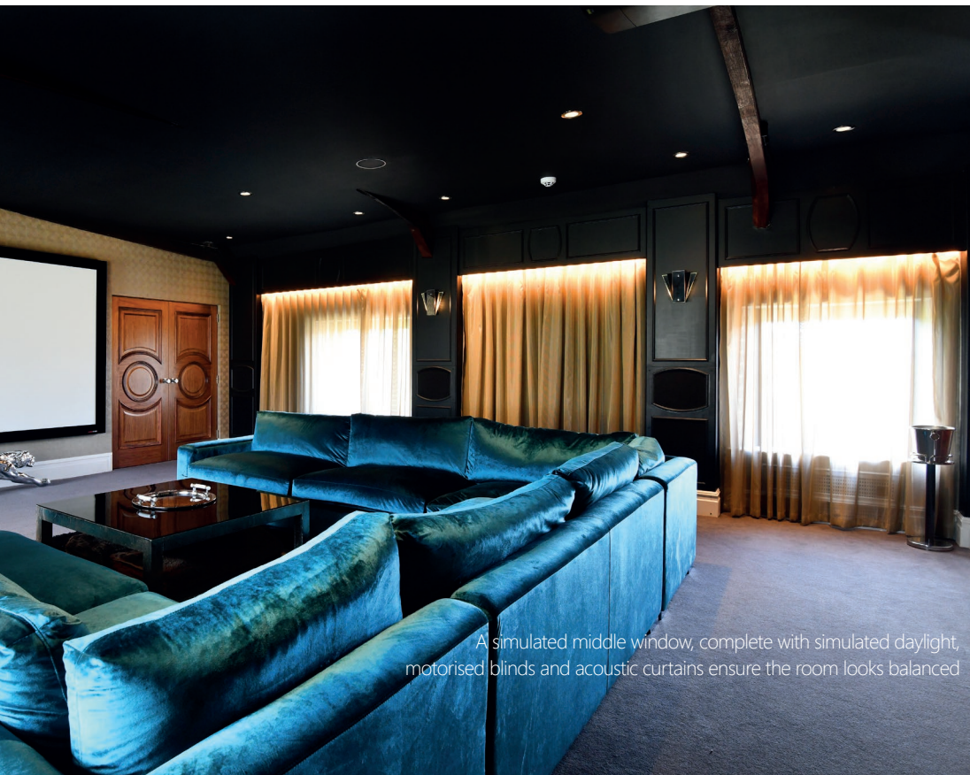
A simulated middle window, complete with simulated daylight, motorised blinds and acoustic curtains ensure the room looks balanced

To optimise picture quality, we sourced a Sony VPL-VW760ES projector capable of presenting 4K Ultra HD visuals onto a 3 m